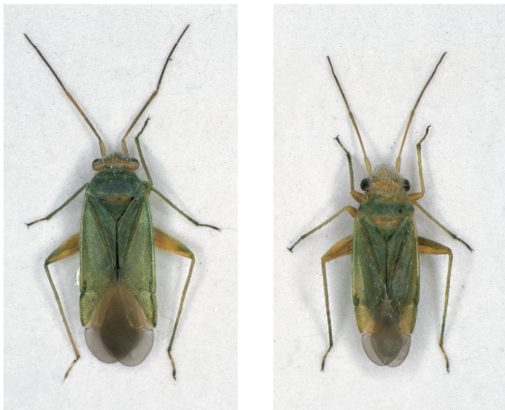
Fig. 1: Platycranus boreae sp. n., left male (holotype), right female (paratype).