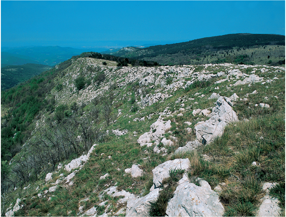
Fig. 6: The habitat of P. boreae sp. n., exposed calcareous ridge of Mt. Lipnik.

Derivatio nominis: The new species is named after bora, the strong and cold northern wind (burja in Slovene, borea in Latin), a strong elemental force in the habitat of P. boreae , situated on the exposed mountain ridge.